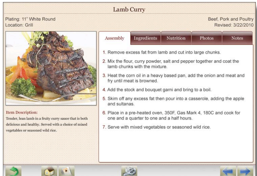
ConnectSmart can also display recipe pictures with assembly and plating information.

From the chef to the expeditor to the server to the manager, the CSK enables every team member to see what is happening with any order at any time.