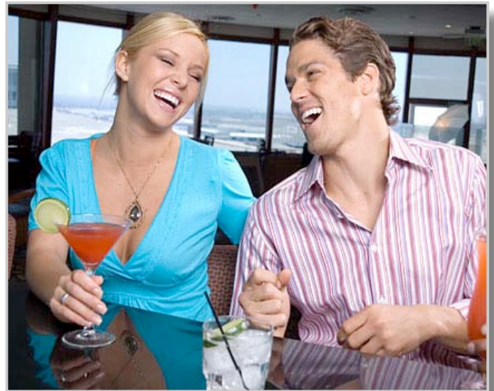
Your guests can relax knowing exactly how much time they have before their table is ready. Plus, your hostess stand won't be overwhelmed with questions about wait times.

A minute later, the screen changes and shows tonight's drink special: martinis, which the woman decides to order while they wait for a table. As they are finishing their drinks, the woman's mobile phone vibrates, and a text message shows that their table is ready. So the couple heads to the hostess stand to be seated.